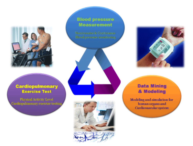
Fig:1 Data Mining in Healthcare

Data mining has many applications in the fields of telecommunication industry, financial data analysis biological data analysis and much more. With the growing research in the field of health informatics a lot of data is being produced. The analysis of such a large amount of data is very hard and requires excessive knowledge. E-healthcare applies data mining and telecommunication techniques for health diagnosis. There are some patients who require continuous check-up and might need doctor help immediately. E-health was primarily used for patient data analysis and disease diagnosis at various levels.